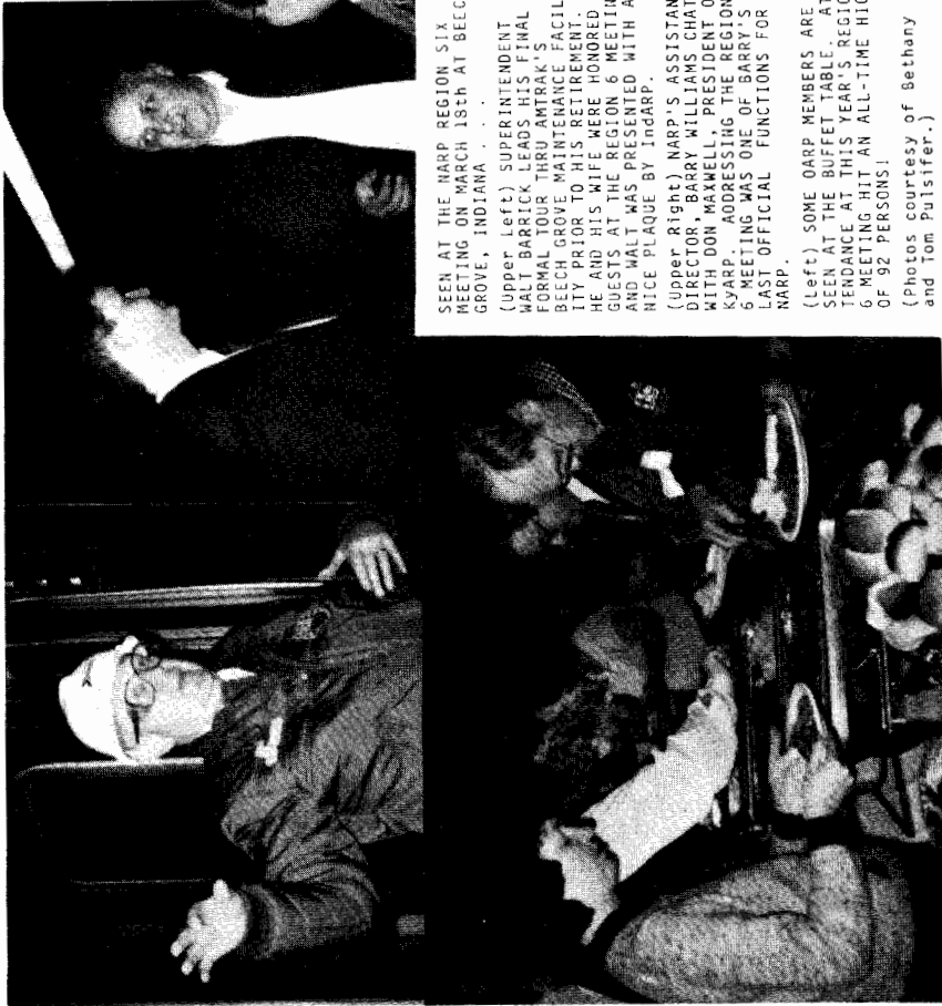
SEEN AT THE NARP REGION SIX MEETING ON MARCH 15th AT BEECH GROVE, INDIANA . . .