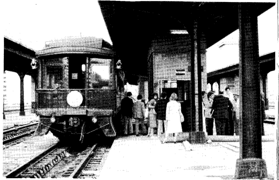
[ABOVE] OARP members toured Dayton Union Station including three cars parked on Track 3 by the Railway Exposition Company for the Miami Valley Hospital Benefit the following day. This is a former Southern Railway business car. The others were a Milwaukee Road full-length dome coach and a former Pennsylvania Railroad Railway Post Office car.