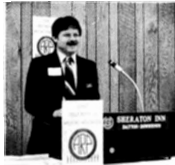
[LEFT] "WELCOME TO DAYTON, OHIO"