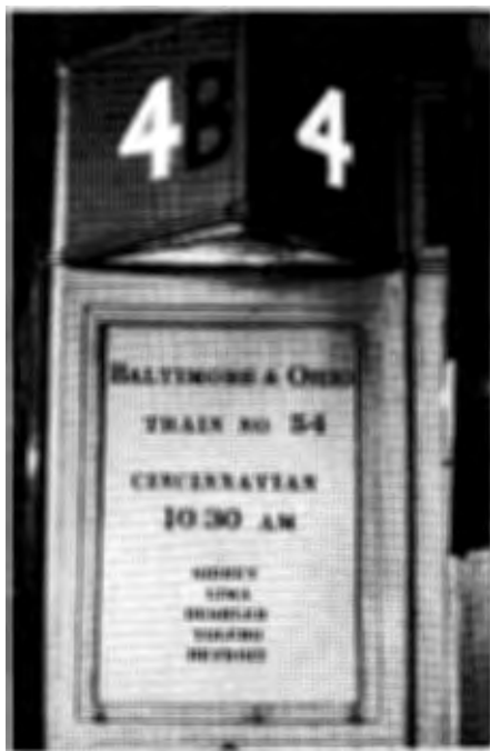
[LEFT] A ghost from the past returns to Dayton Union Station. Each track gate announcement board in the depot was adorned with an actual sign or replica representing many of the more famous passenger trains that once served Dayton, Ohio. Many hours of very hard work by a lot of volunteers transformed a dingy Dayton Union Station into a brighter and cleaner facility for the Miami Valley Hospital's Benefit fund-raiser held in the afternoon of May 23rd. OARP assisted in several ways with this event and, in return, we were granted permission to tour the Station on the afternoon of our Annual Meeting on May 22nd.