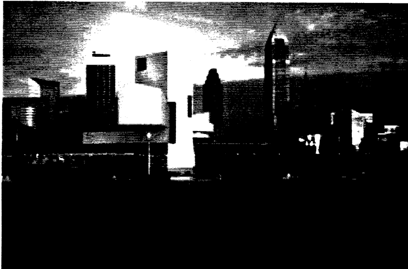
Rock & Roll Hall of Fame and Science Center are new additions to Cleveland's skyline.

NOTE: There is no rail access, but very frequent, 24-hour bus services on Euclid Ave. link Playhouse Square to RTA's Tower City Center rail station at Public Square.